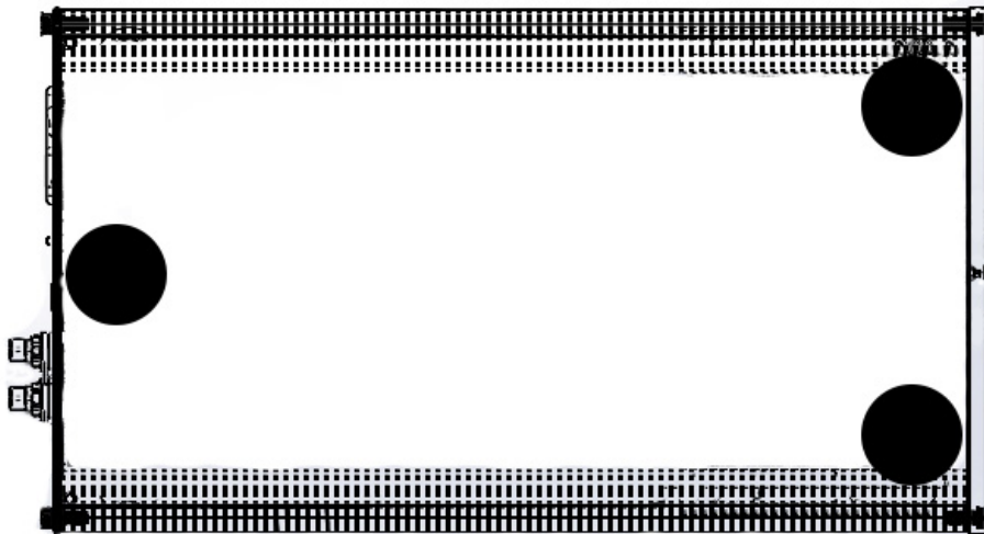
Mystique Y Footer Placemet

If you decide to use our stock footers, please refer to the above graphic. Place two footers close to the left and right edges of the chassis directly behind the face plate. Place the third footer centered directly in front of the rear plate. Note that there is a center notch on the bottom edge of the rear plate to aide in center alignment.